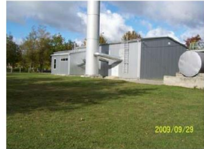
Figure 15 After the upgrading process

This led to a remarkable increase in the DH energy efficiency , such as a decrease of technical losses in DH networks, water, electricity and fuel consumption for the generation and supply of heat.