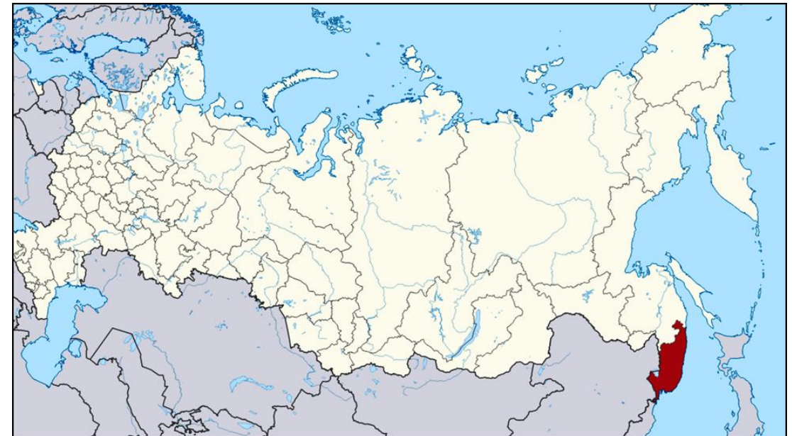
Primorje Region in the far east of Russia