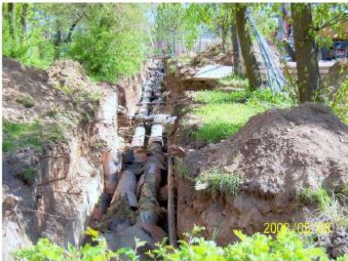
Figure 16 Old exposed pipelines