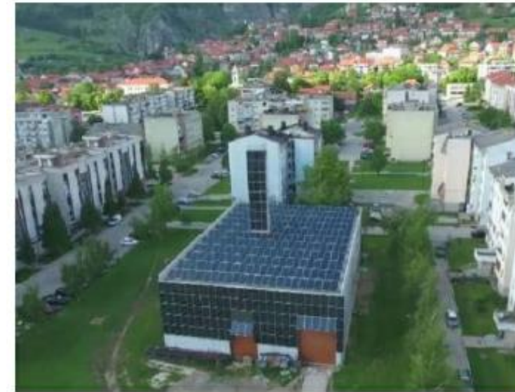
Figure 19 After the upgrading process

The Project's Cashflow presents an Economic Benefit after Year Seven