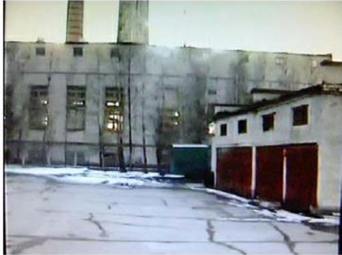
Figure 14 Before the upgrading process

Akmenės energija has implemented several renovation measures in the district heating system: