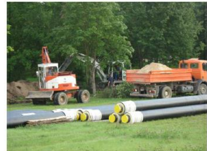
Figure 17 New cased underground pipelines