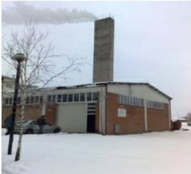
Figure 18 Before the upgrading process