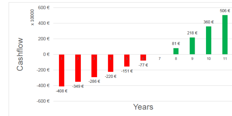
Figure 20 Expected project's cashflow in eleven years, based on: www.unecce.org

The Project's Cashflow presents an Economic Benefit after Year Seven